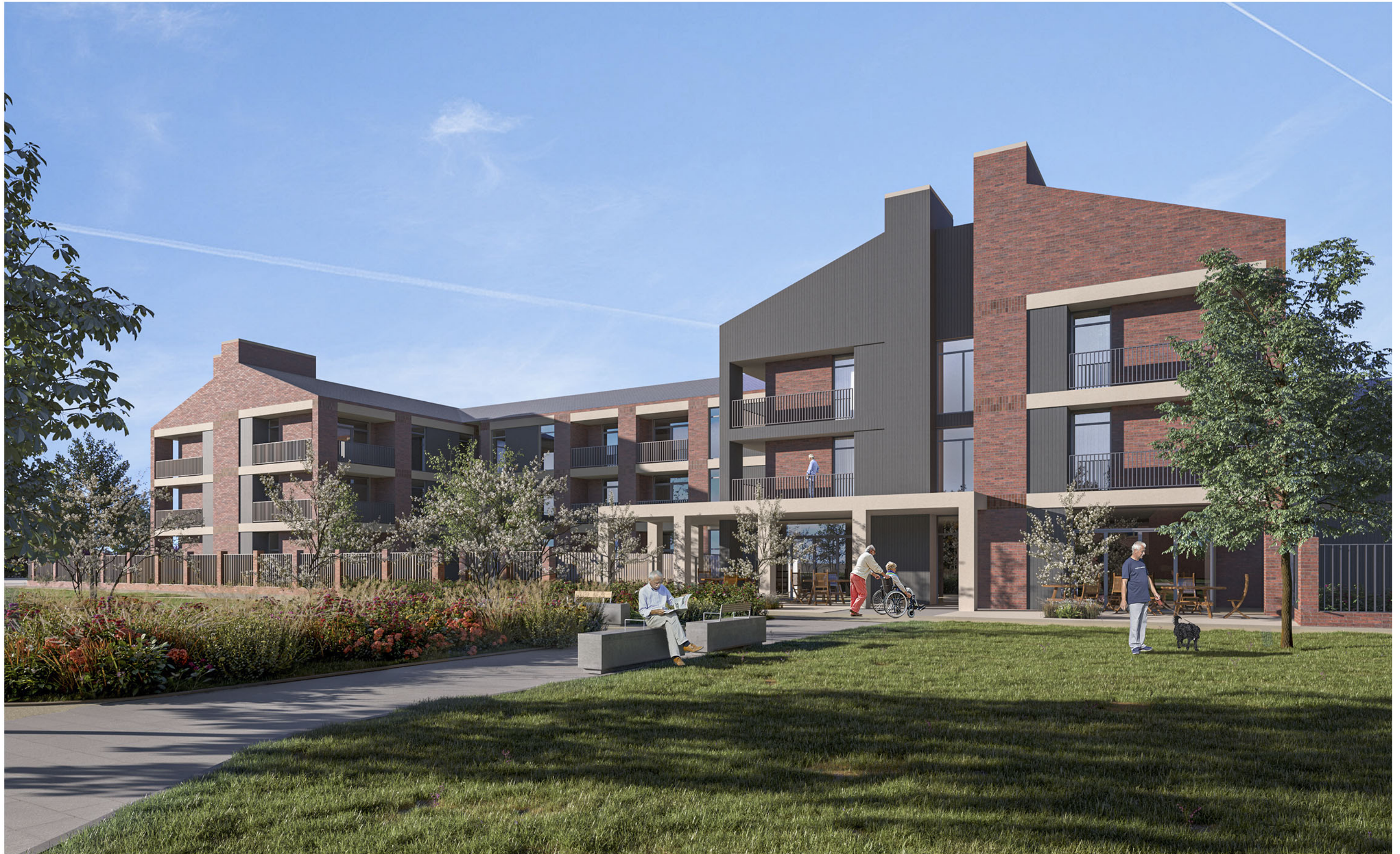
Donnington Wood Way, Telford - Extra Care View 1